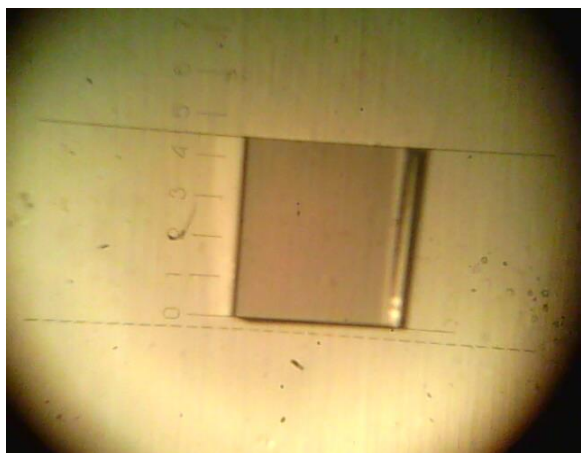
Fig. 1. Diamond substrate

Realization of that scientific idea in concrete types of instruments is mainly defined on the technological possibilities. Thus, development of the technological problem is a priority problem to science and technology in the constructing instruments spheres. General technological solution for receiving new types of product from preprocessing as the described new type of material demands exact and specific technological approaches to such new material (Grigoriev et al., 1981; 1983; Natural Diamonds... , 1997; Pleskov, 2003; Mityagin et al.).