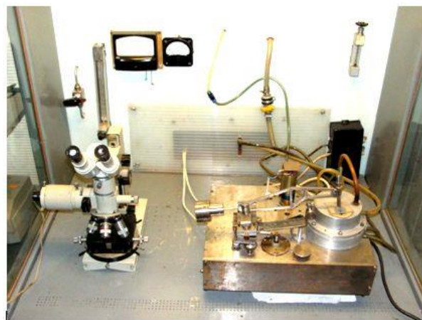
Fig. 4. An experimental sample for the thermochemical method installation: processing diamond (modification PTC "URALALMAZINVEST")