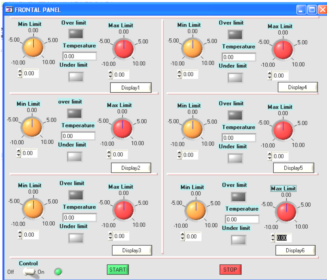
Fig. 3. The front panel control interface

In figure 3 is shown the front panel control and visualization and it represents the interface between the purchasing system and human operator.