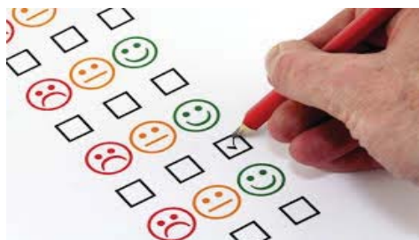
Fig.4. Test solution

The test is a multipurpose concept, which means a testing, probing, testing, inquiring, method in the pedagogic, psychology, medicine, sport, etc. According to the English dictionary, "test" means testing or probing something, in order to define its quality, value, composition, etc. In the education, test means measuring of the knowledge, skill, intelligence or possibilities of an individual or group of individuals (Tujarov,2009).