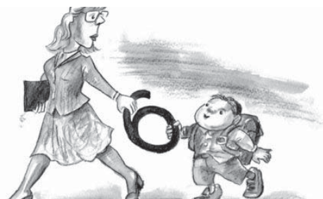
Fig.2. The role of evaluation