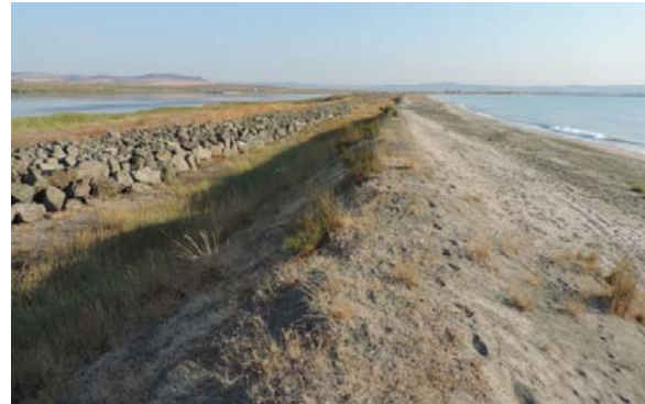
Fig. 4. The sandy bar between the Black Sea and the Pomorie lagoon

which is gradually pushed from the surf to the shoreline as it rises above the water and completely isolates the lagoon from the sea (Fig. 4). The Pomorie lagoon is formed as a double tombolo (Popov, Mishev, 1974) by two sandy bars connecting the island of Pomorie with the land. It was formed in historical times and is associated with the Nymphaean transgression that submerged the Black Sea coastline 1000-1500 years ago. The recent researches confirm the tendency for continuing subsidence of the coast. Citing a study of the last century Kanev (1988) concluded that the old road between Anhiolo (Pomorie) and Mesemvria (Nessebar) is situated below the Pomorie Lake where a stone pavement was discovered 50 m away from the coastline and 1 m below the lake's surface.