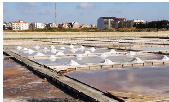
Fig. 9. The Museum of salt in Pomorie is a complex of water basins, channels, and other attributes of the ancient Anhialo's technology for the extraction of sea salt

Apolonia is the most ancient town in Bulgaria founded in 610 BC. The surrounding shallows keep the secrets of the thriving civilization on the western Black Sea coast submerged under sea level. Ancient Greek vases from VII-II century BC, Roman amphorae, coins, ceramic and glassware from I-VI century AD and many artifacts of the many-thousand-year history of the town are saved in the municipal Archaeological museum.