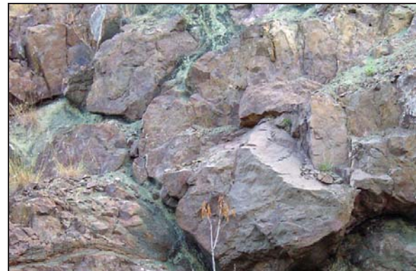
Fig. 6. The type locality of Upper Cretaceous pillow lavas defined as a separate rock type "bulgarite" near Bulgarovo village

Paleozoic and Precambrian rocks crop out in Strandzha Mountain on the territory of Sredets Municipality.