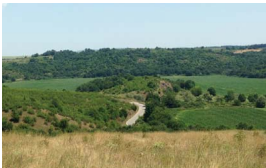
Fig. 7. The caldera of the Zidarovo volcano with bottom covered by deposits of the Nymphaean marine terrace

Jurassic is represented by several formations of the East Thracian Group (Chatalov, 1985a, 1995). The underlying sediments of the Kubarelov Formation (Hettangian-Sinemurian) are represented of quartzitized sandstones and quartzites cropping out as a long strip between Golyamo Bukovo and Zvezdets villages. The younger Kraynovo Formation (Pliensbachian) is composed of different types of marbles and recrystallized limestones cropping out south of Zvezdets village. The Varovnik Formation (Pliensbachian-Bajocian) represents an alternation of biotrititic limestones and fine-grained ferritized sandstones. It crops out only between the villages of Varovnik and Golyamo Bukovo. The Bliznak Formation (Sinemurian-Toarsian) is composed of quartz sandstones. It crops out as a long strip between the villages of Zvezdets and Bliznak. The Zvezdets Formation (Bajocian) cropping out between Zvezdets and Golyamo Bukovo villages is represented by black shales quartzitized sandstones and rare limestone beds.