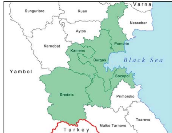
Fig. 2. Burgas District with the composite municipalities of the Burgas Lakes Geopark

However, despite their unique landscapes, Bourgas and Pomorie municipalities do not have the necessary geodiversity to develop a successful geopark. According to the requirements, it must have a sufficiently large territory, which, apart from the sites of the geological heritage of international significance, must also include sites of historical and spiritual value and serve the local economic and cultural development. For this reason the geopark format must include at least two or three adjacent municipalities that can contribute with their geodiversity for the overall geopark concept. From this point of view, the inclusion of the municipalities of Kameno, Sozopol and Sredets will satisfy the requirements for the provision of the necessary geosites of international importance and allow the start of the geopark establishment procedure (Fig. 2).