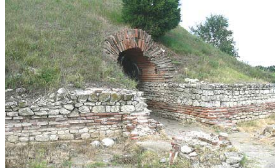
Fig. 8. The ancient Thracian tomb in Pomorie built in 1 st -2 nd century AD

Bulgaria and Eastern Europe specialized in the production of salt through the natural evaporation of sea water by the sun's heat. It is an original complex of water basins, channels, and other attributes of the ancient Anhialo's technology for the extraction of sea salt, representing an intangible heritage for the area (Fig. 9).