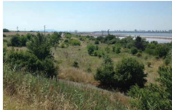
Fig. 5. The Nymphaean terrace east of the Atanasovsko Lake

Burgas Lake is the largest natural lake in Bulgaria with a length of 9.6 km, a width of 5 km and an area of about 28 km 2 , with a depth up to 1.3 m. It represents a liman, separated from the Black Sea by the sandy bar "Kumluka" and connected to it by a narrow channel.