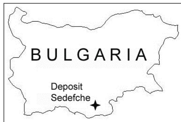
Fig. 1. Location of the Sedefche deposit in the Republic of Bulgaria.

area of the deposit consists of two tectonic complexes (Georgiev, 2012):