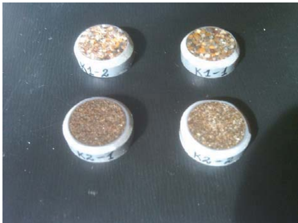
Fig. 3. Specimens of heavy minerals' fractions bonded with polymer resin and polished ("briquettes").

with pan to extract heavy fraction K2. In the same way as above, two more briquette-like specimens were made from it (K2-1 and K2-2) (Fig. 3).