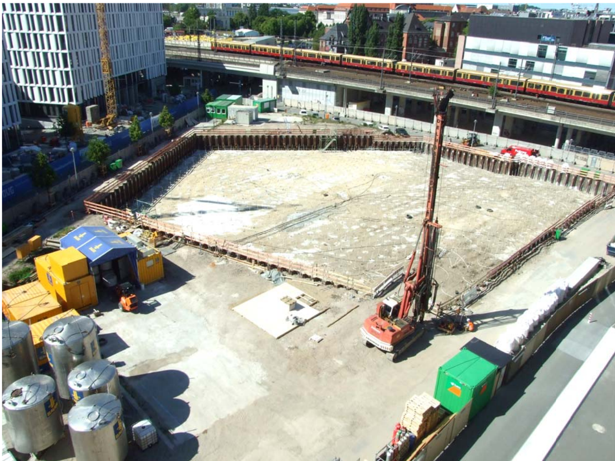
Fig.1. Construction trench during sheet pile wall installation

The groundwater and soil analyses took place over the entire construction period from May 2015 to July 2016. The groundwater extraction wells were positioned outside the construction trench in a depth of approximately 19m. The lower edge of the installed sheet pile walls reached a depth 0.5m below the grouted silicate gel sealing sole layer.