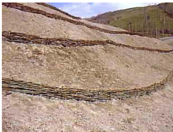
Fig. 1. Work to prevent soil erosion and to drain the dripping waters