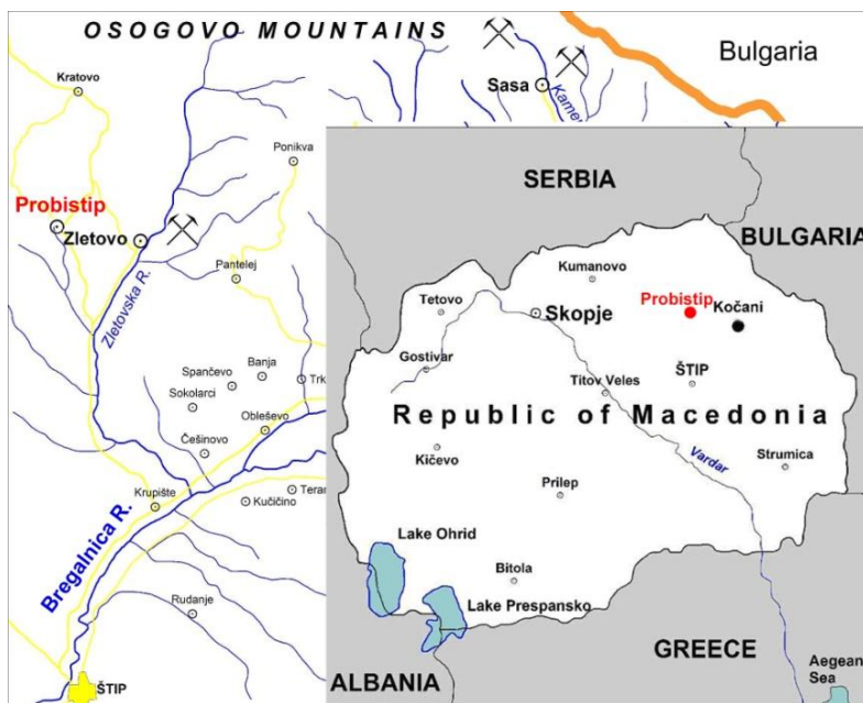
Fig. 1. Map of the survey area, SE Macedonia

human environment. A number of reagents of various chemical composition and origin are used in the processing of lead and zinc ores. Most of the reagents are toxic and hazardous for the environment.