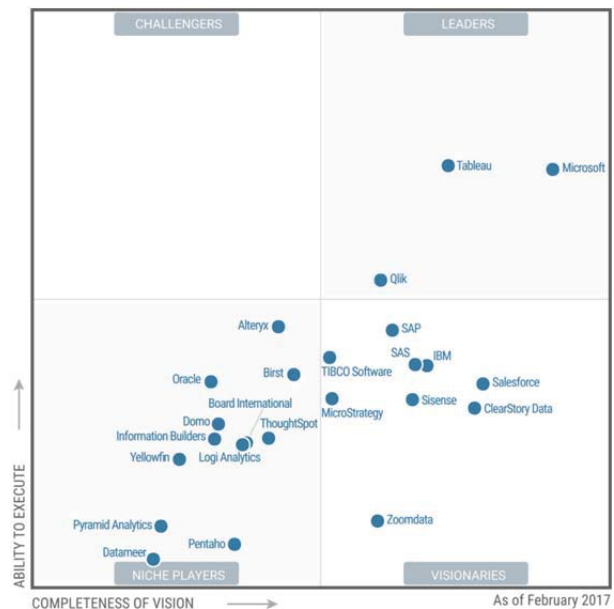
Fig. 2. Gartner's Magic Quadrant

The Magic Quadrant helps in choosing the right product. It classifies the BI solutions in four smaller quadrants – Niche Players, Challengers, Visionaries и Leaders (Fig. 2).