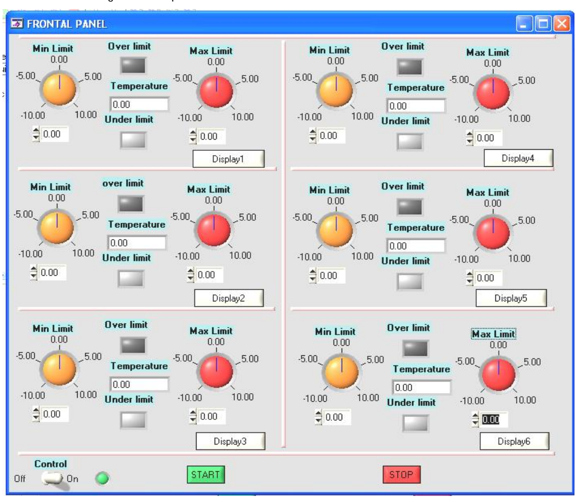
Fig. 3. The front panel control interface

In figure 3 is shown the front panel control and visualization and it represents the interface between the purchasing system and human operator.