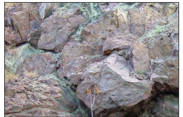
Fig. 6. The type locality of Upper Cretaceous pillow lavas defined as a separate rock type "bulgarite" near Bulgarovo village

Paleozoic and Precambrian rocks crop out in Strandzha Mountain on the territory of Sredets Municipality.