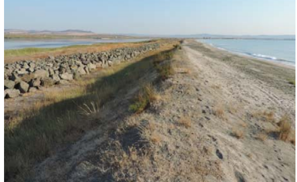
Fig. 4. The sandy bar between the Black Sea and the Pomorie lagoon

which is gradually pushed from the surf to the shoreline as it rises above the water and completely isolates the lagoon from the sea (Fig. 4). The Pomorie lagoon is formed as a double tombolo (Popov, Mishev, 1974) by two sandy bars connecting the island of Pomorie with the land. It was formed in historical times and is associated with the Nymphean transgression that submerged the Black Sea coastline 1000-1500 years ago. The recent researches confirm the tendency for continuing subsidence of the coast. Citing a study of the last century Kanev (1988) concluded that the old road between Anhialo (Pomorie) and Mesemvria (Nessebar) is situated below the Pomorie Lake where a stone pavement was discovered 50 m away from the coastline and 1 m below the lake's surface.