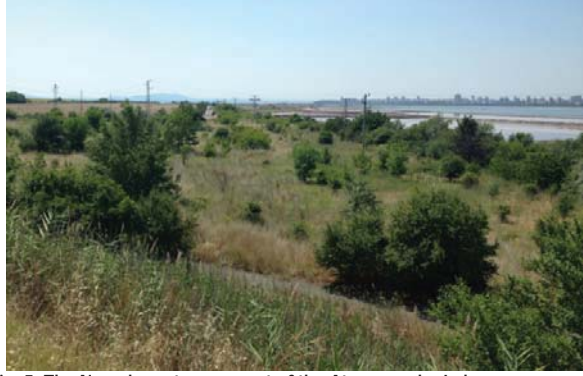
Fig. 5. The Nymphean terrace east of the Atanasovsko Lake

Burgas Lake is the largest natural lake in Bulgaria with a length of 9.6 km, a width of 5 km and an area of about 28 km<sup>2</sup>, with a depth up to 1.3 m. It represents a liman, separated from the Black Sea by the sandy bar "Kumluka" and connected to it by a narrow channel.