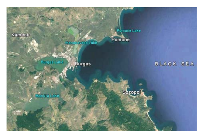
Fig. 1. Satellite image of the Burgas Lakes Complex

Pomorie and Atanasovsko Lakes are unique in the Balkans with the balneo-healing properties of their salty water and anaerobic mud deposits as well as with their endemic plants and animals. On the other side, the various geological structure, remarkable landscapes, rich cultural and historical heritage and well developed coastal tourism are good prerequisites for development of geotourism and other sustainable forms of tourism – ecotourism, rural tourism and mountain tourism that will be a successful complementation to the traditional coastal, spa and balneo-tourism and will provide conditions for all-season engagement of the hotels. Simultaneously geosites and geotrails development inland from the coast will provide a good possibility for the promoting of the geological and cultural-historical heritage of the area through new tourist packets.