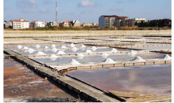
Fig. 9. The Museum of salt in Pomorie is a complex of water basins, channels, and other attributes of the ancient Anhialo's technology for the extraction of sea salt

Apolonia is the most ancient town in Bulgaria founded in 610 BC. The surrounding shallows keep the secrets of the thriving civilization on the western Black Sea coast submerged under sea level. Ancient Greek vases from VII-II century BC, Roman amphorae, coins, ceramic and glassware from I-VI century AD and many artifacts of the many-thousand-year history of the town are saved in the municipal Archaeological museum.