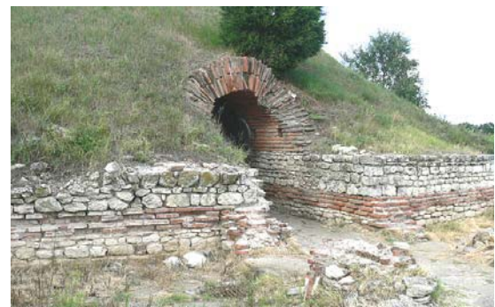
Fig. 8. The ancient Thracian tomb in Pomorie built in 1st -2nd century AD

Bulgaria and Eastern Europe specialized in the production of salt through the natural evaporation of sea water by the sun's heat. It is an original complex of water basins, channels, and other attributes of the ancient Anhialo's technology for the extraction of sea salt, representing an intangible heritage for the area (Fig. 9).