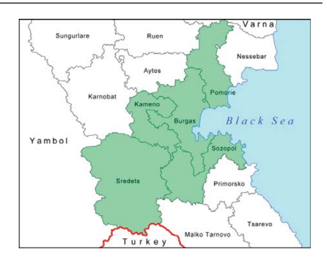
Fig. 2. Burgas District with the composite municipalities of the Burgas Lakes \ensuremath{\mathsf{Geopark}}

However, despite their unique landscapes, Bourgas and Pomorie municipalities do not have the necessary geodiversity to develop a successful geopark. According to the requirements, it must have a sufficiently large territory, which, apart from the sites of the geological heritage of international significance, must also include sites of historical and spiritual value and serve the local economic and cultural development. For this reason the geopark format must include at least two or three adjacent municipalities that can contribute with their geodiversity for the overall geopark concept. From this point of view, the inclusion of the municipalities of Kameno, Sozopol and Sredets will satisfy the requirements for the provision of the necessary geosites of international importance and allow the start of the geopark establishment procedure (Fig. 2).