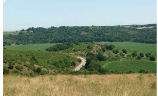
Fig. 7. The caldera of the Zidarovo volcano with bottom covered by deposits of the Nymphean marine terrace

Jurassic is represented by several formations of the East Thracian Group (Chatalov, 1985a, 1995). The underlying sediments of the Kubarelov Formation (Hettangian-Sinemurian) are represented of quartzitized sandstones and quartzites cropping out as a long strip between Golyamo Bukovo and Zvezdets villages. The younger Kraynovo Formation (Pliensbachian) is composed of different types of marbles and recrystallized limestones cropping out south of Zvezdets village. The Varovnik Formation (Pliensbachian-Bajocian) represents an alternation of biodetritic limestones and fine-grained ferritized sandstones. It crops out only between the villages of Varovnik and Golyamo Bukovo. The Bliznak Formation (Sinemurian-Toarsian) is composed of guartz sandstones. It crops out as a long strip between the villages of Zvezdets and Bliznak. The Zvezdets Formation (Bajocian) cropping out between Zvezdets and Golyamo Bukovo villages is represented by black shales quartzitized sandstones and rare limestone beds.